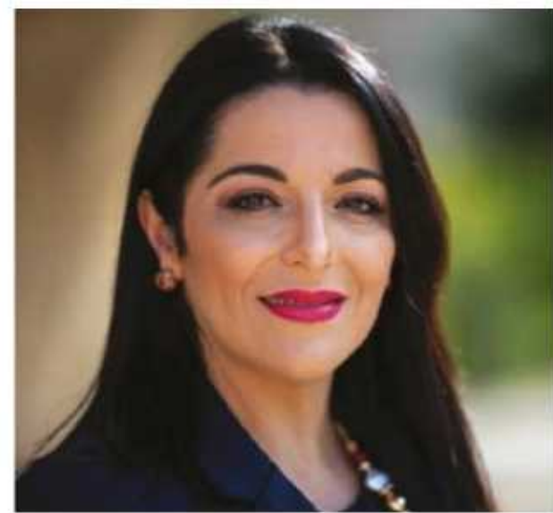
JULIA FARRUGIA PORTELLI Minister for Tourism and Consumer Protection, Malta

With this and related measures Malta, is signalling its intentions as a small island State, with a big tourism economy, to also be a Climate Friendly Travel leader.